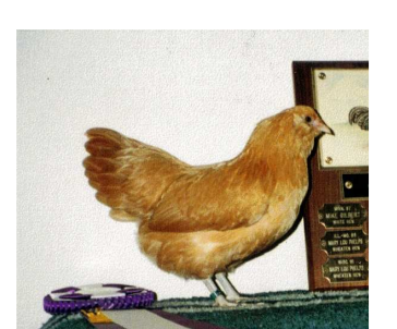
Buff Bantam Pullet