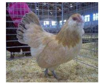
2008 Wheaten Bantam By the Pickard Family

Basically the chicks are $6 each, plus box, PO shipping charge and a small fee for delivering them to our PO for shipment. We offer priority mail only through shipping zone #4; all others must go by express live mail as we guarantee live chicks upon arrival, or a refund for any that don't make the trip-which is very few. There is a minimum of 10 so they will stay warm enough during shipping. Presently we have sold our Ameraucanas into 39 states and Canada. It looks like Hawaii may be our 49th state.