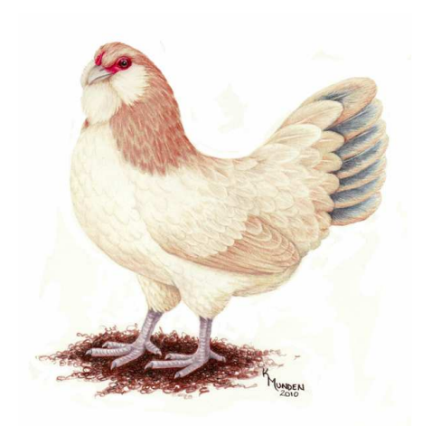
Accepted wheaten bantam Ameraucana Hen portrait 2010